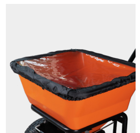
RAIN COVER INCLUDED