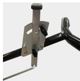
ERGONOMIC FLOW CONTROL