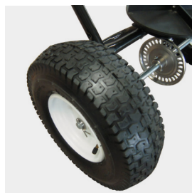
LARGE PNEUMATIC TYRES