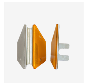
SINGLE OR DOUBLE-SIDED VERSIONS