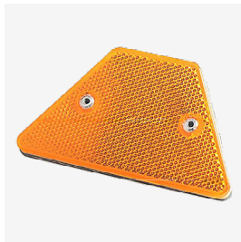
HIGHLY REFLECTIVE PMMA REFLECTOR