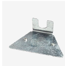
GALVANISED STEEL PLATE