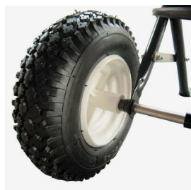
LARGE PNEUMATIC TYRES