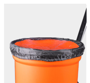
RAIN COVER INCLUDED