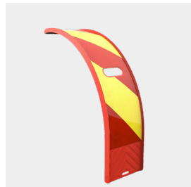
MADE OF POLYPROPYLENE