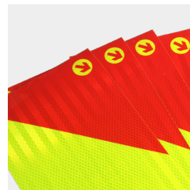
HIGHLY REFLECTIVE SHEETINGS