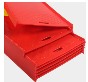
SAVE PACKING STORAGE