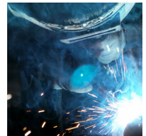
SEAMLESS, STRONG WELD