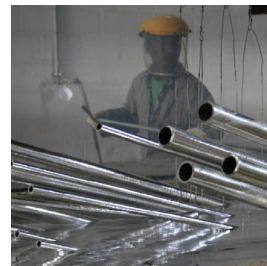
HOT-DIP GALVANISED FINISH