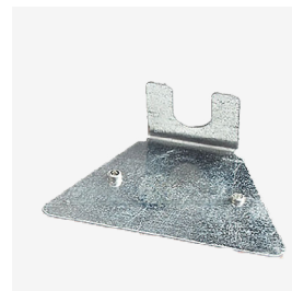
GALVANISED STEEL PLATE